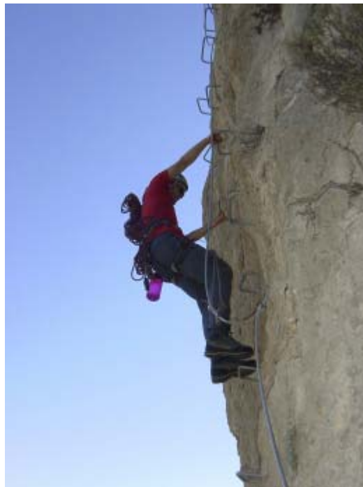
Enjoying one of the steeper sections of the Costa Blanca Via Ferrata

Head up from the top of the via ferrata for a few metres and then follow a path which contours right (facing in) across the hillside. Well signed. Follow the path down and right (facing in) past some scrambling until two 30m abseils are reached. Descend these to the base of the cliff where it is possible to descend reasonably directly towards the parking.